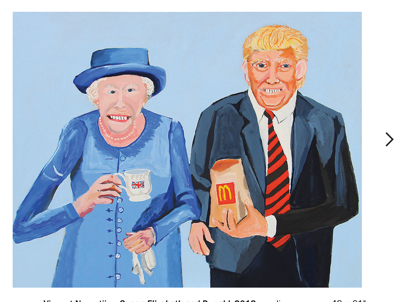
Vincent Namatjira, Queen Elizabeth and Donald, 2018, acrylic on canvas, 48 × 61".

also as a mass-media brand, her pearl necklace and crown signifiers of her wealth and nationhood. The Aboriginal flag pin worn by Namatjira in the painting is significant too, perhaps alluding to recent copyright disputes stemming from the 2018 sale of the flag's reproduction rights to a non-indigenous-owned clothing company, which plunged this revered symbol of Aboriginal sovereignty into an ethical quandary. Namatjira uses the Aboriginal flag in his work to draw on its cultural prestige, giving him equal footing among the power brokers he ensnares in his imagined biographical web. In other paintings, such as Queen Elizabeth and Donald , 2018, he undercuts personal style—in this case, Trump's long tie and the queen's hat—with the inclusion of consumer goods: You-know-who holds a McDonald's takeout bag, and Her Royal Highness a souvenir teacup imprinted with the Union Jack. Here, the meeting of two "great nations" is just an opportunity to hawk cheap wares.