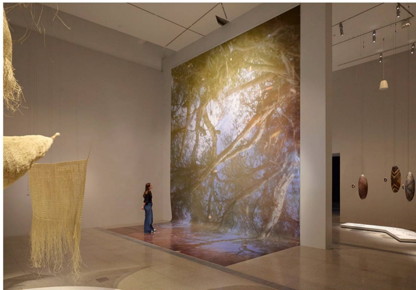
Installation view of FUTURE COUNTRY: Country Road x NGV First Nations Commissions from 20 March – 13 September at The Ian Potter Centre: NGV Australia, Melbourne.