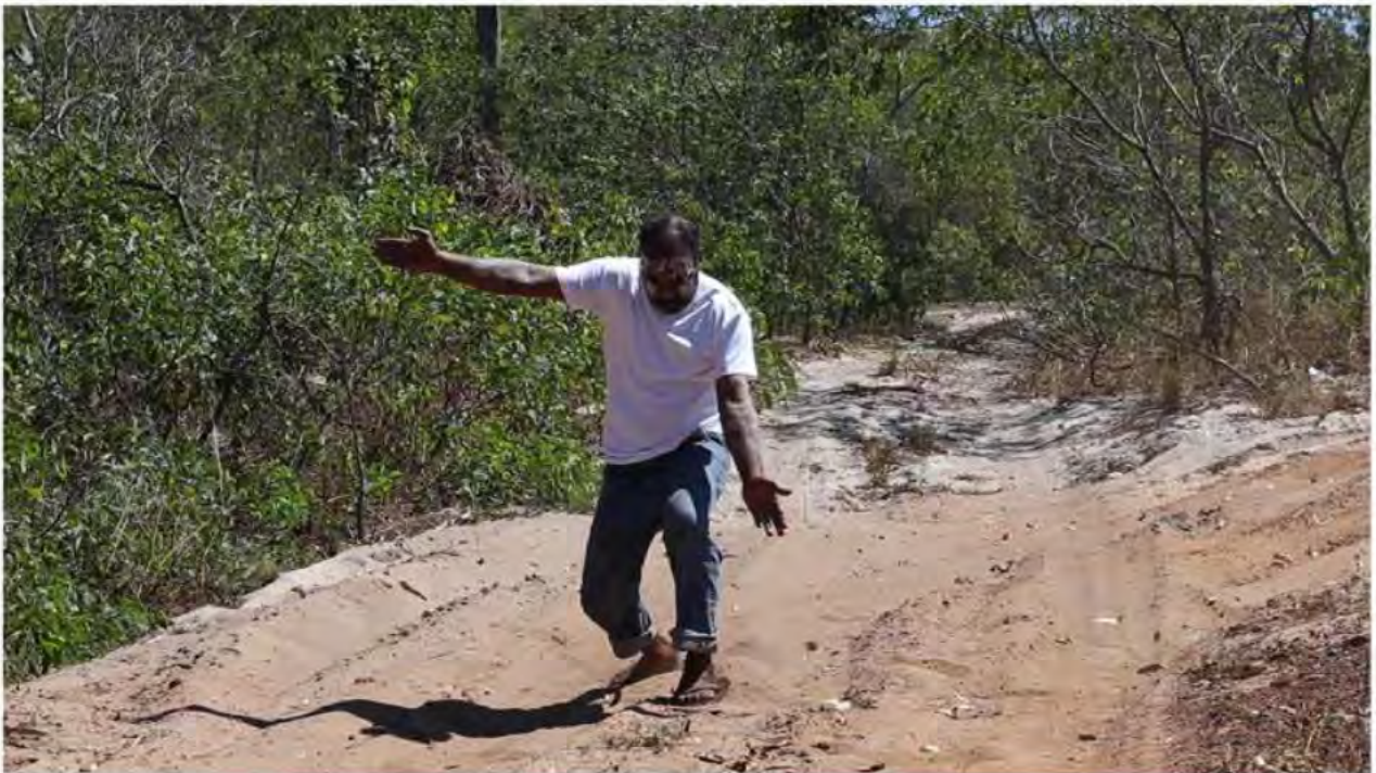
Johnathon World Peace Bush Tartuwali Yoyi (shark dance) 2020 1 minute 30 seconds, single-channel video edition of 5 + 2AP