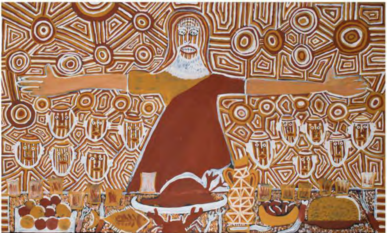
Johnathon World Peace Bush Rio Jesus and the Last Supper 2021 120cm x 200cm Locally sourced earth pigments on linen