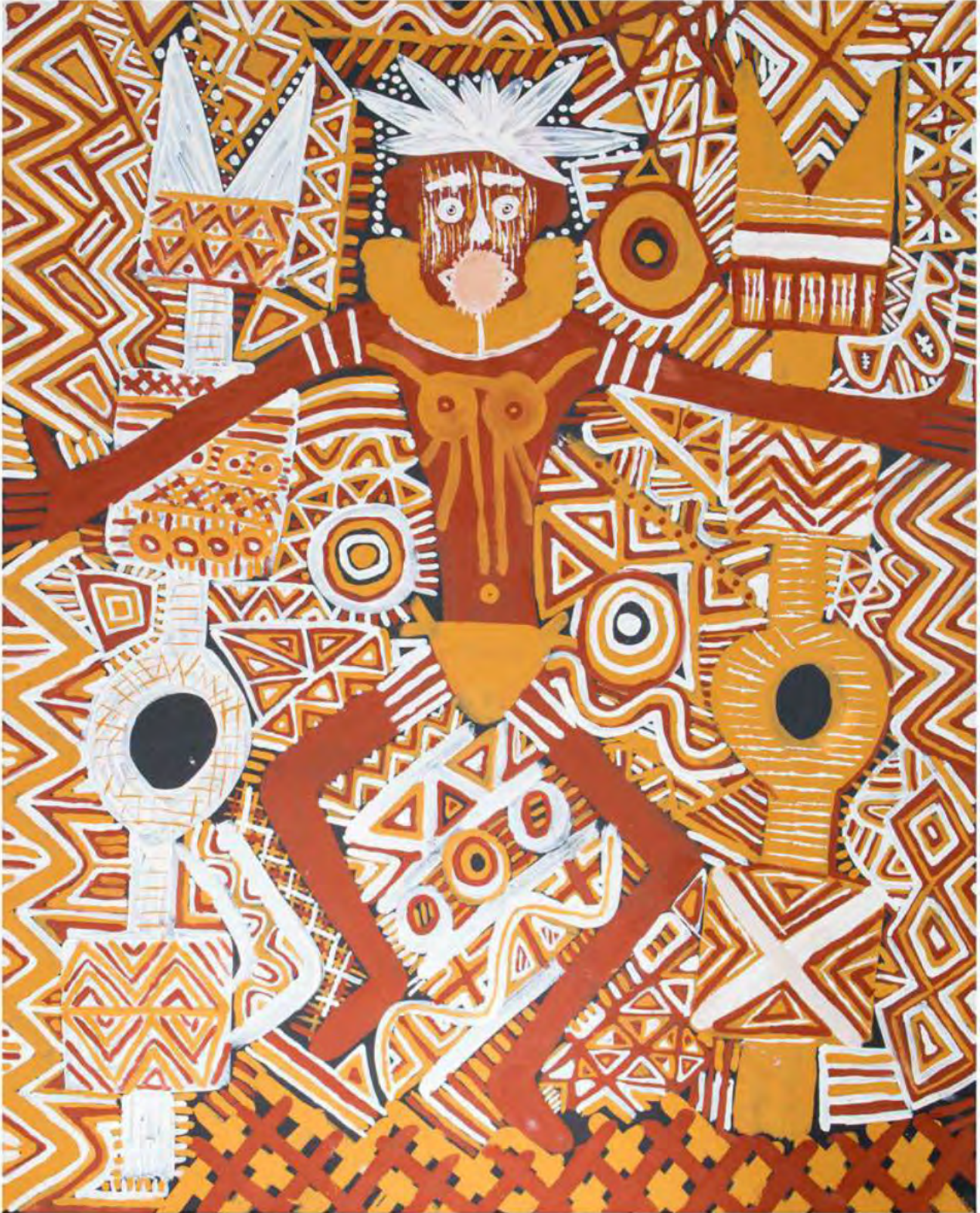
Johnathon World Peace Bush Yoyi (dance) 2021 150cm x 120cm Locally sourced earth pigments on linen