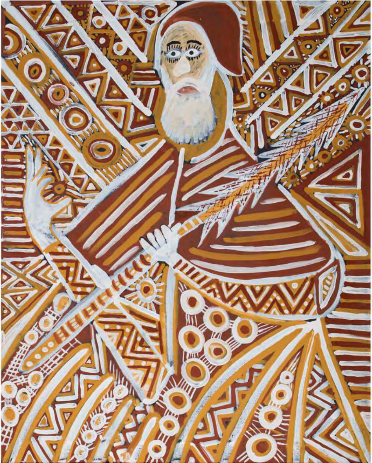
Johnathon World Peace Bush Pope Sixtus 2021 150cm x 120cm Locally sourced earth pigments on linen