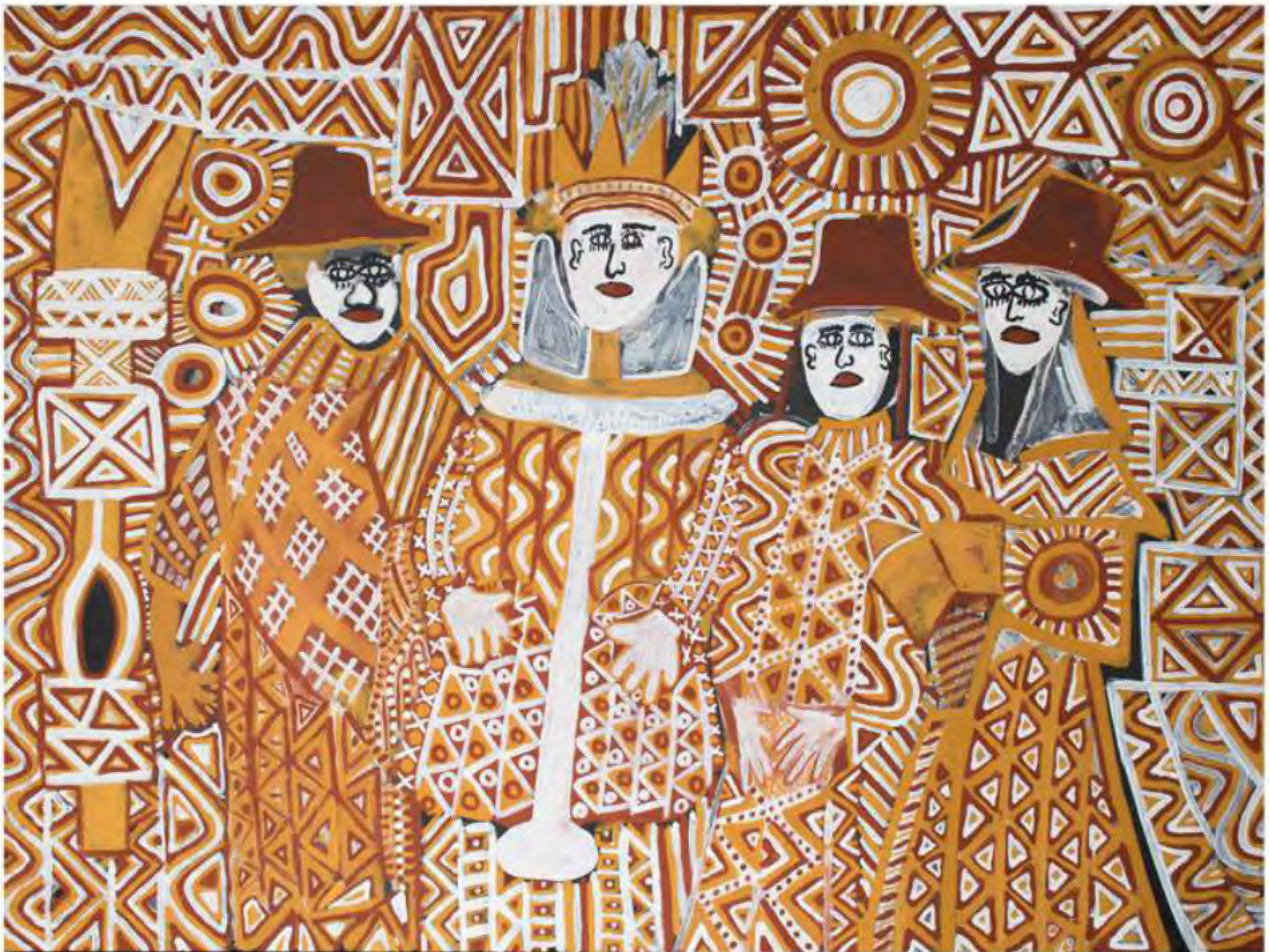
Johnathon World Peace Bush Murrintawi (white people) 2021 150cm x 200cm Locally sourced earth pigments on linen