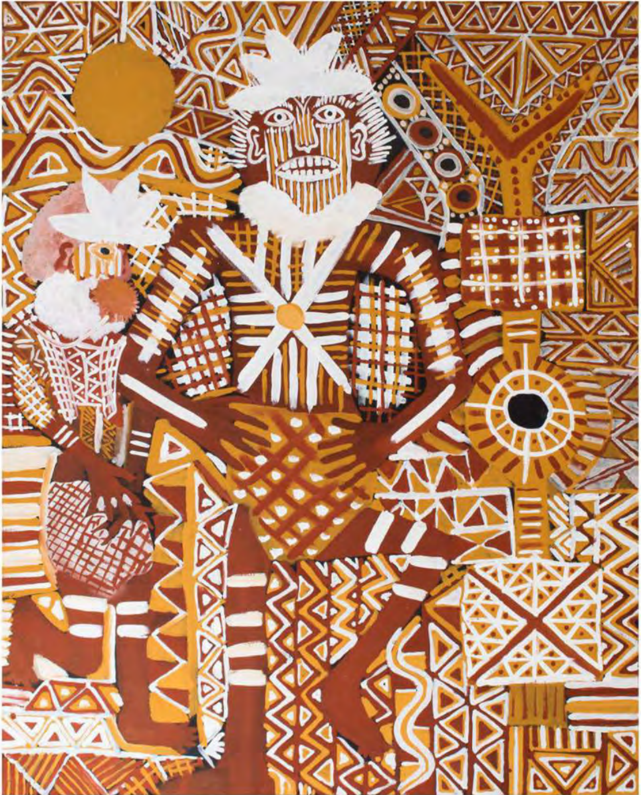
Johnathon World Peace Bush Wulimawi (old people) 2021 150cm x 120cm Locally sourced earth pigments on canvas