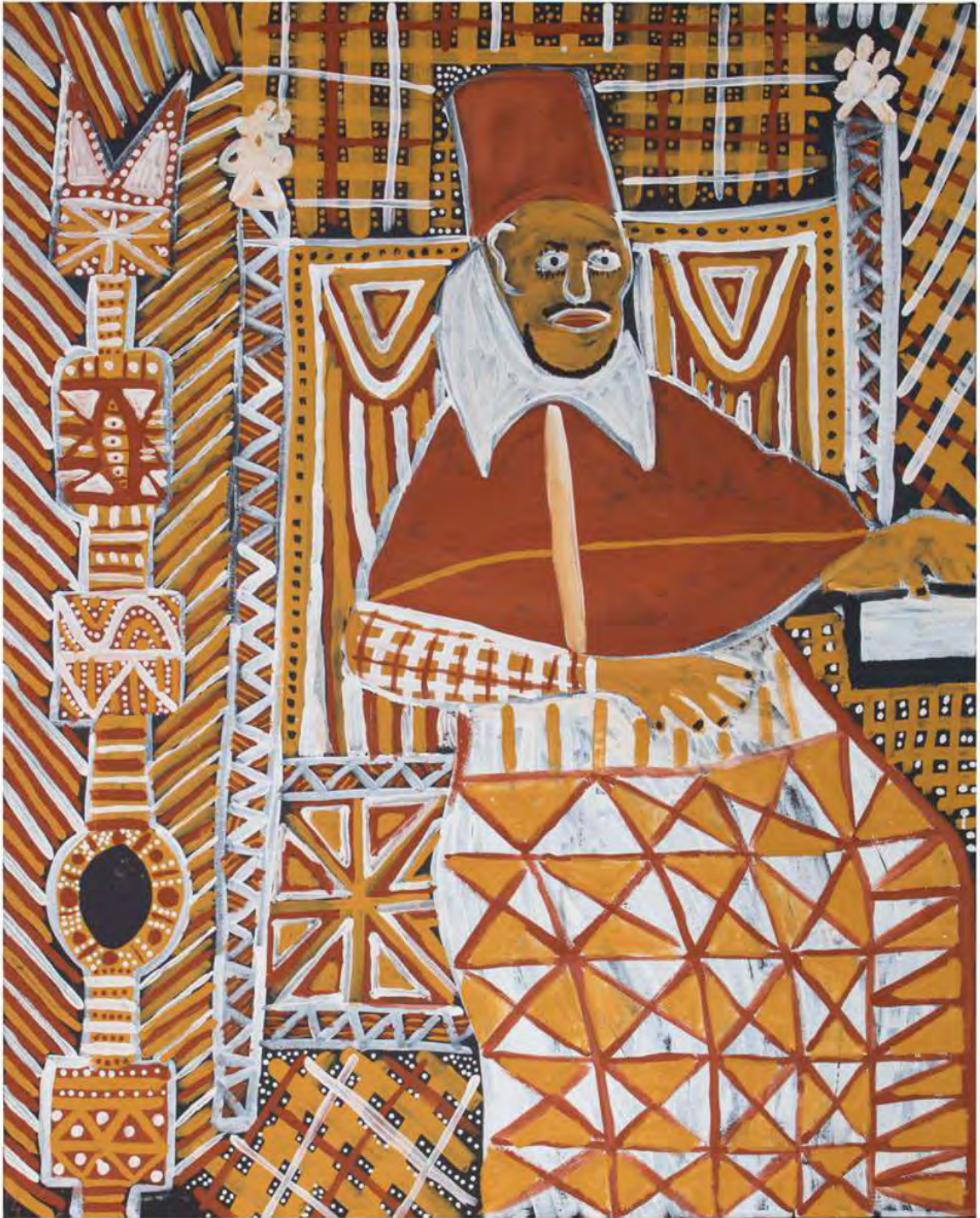
Johnathon World Peace Bush Pope Innocent 2021 150cm x 120cm Locally sourced earth pigments on linen