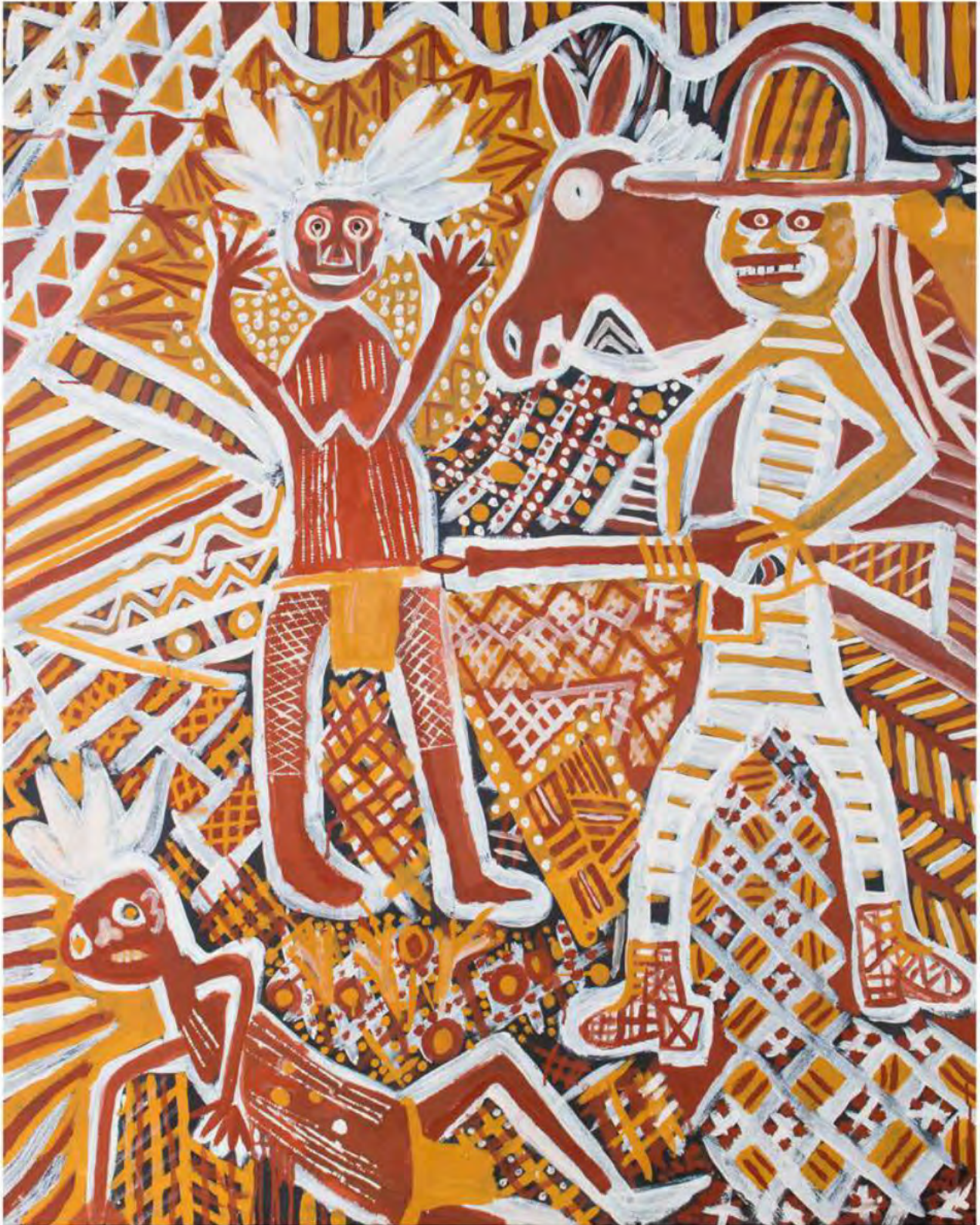
Johnathon World Peace Bush Black Lives Matter 2020 150cm x 120cm Locally sourced earth pigments on canvas