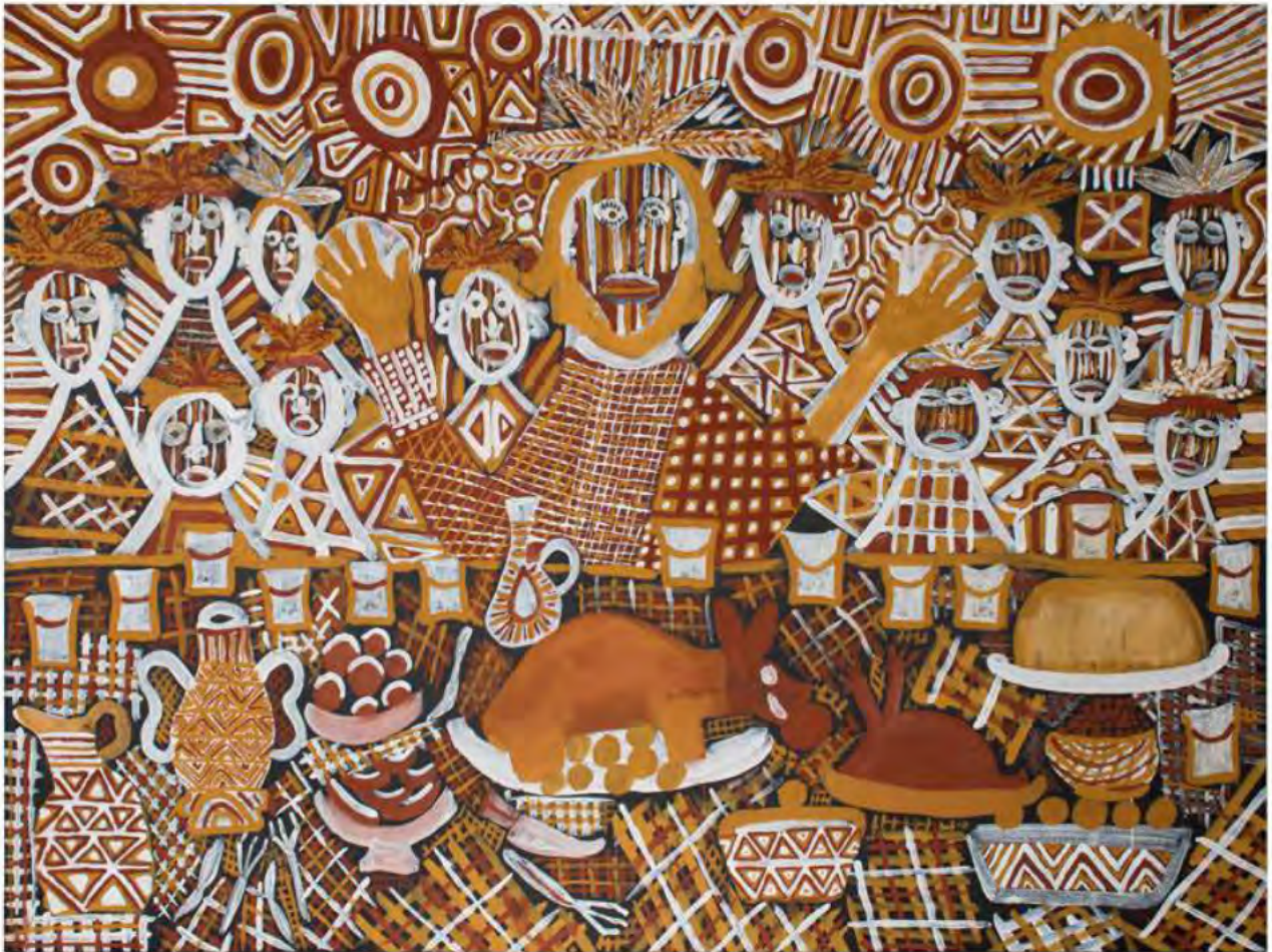
Johnathon World Peace Bush The Last Supper 2021 150cm x 200cm Locally sourced earth pigments on linen