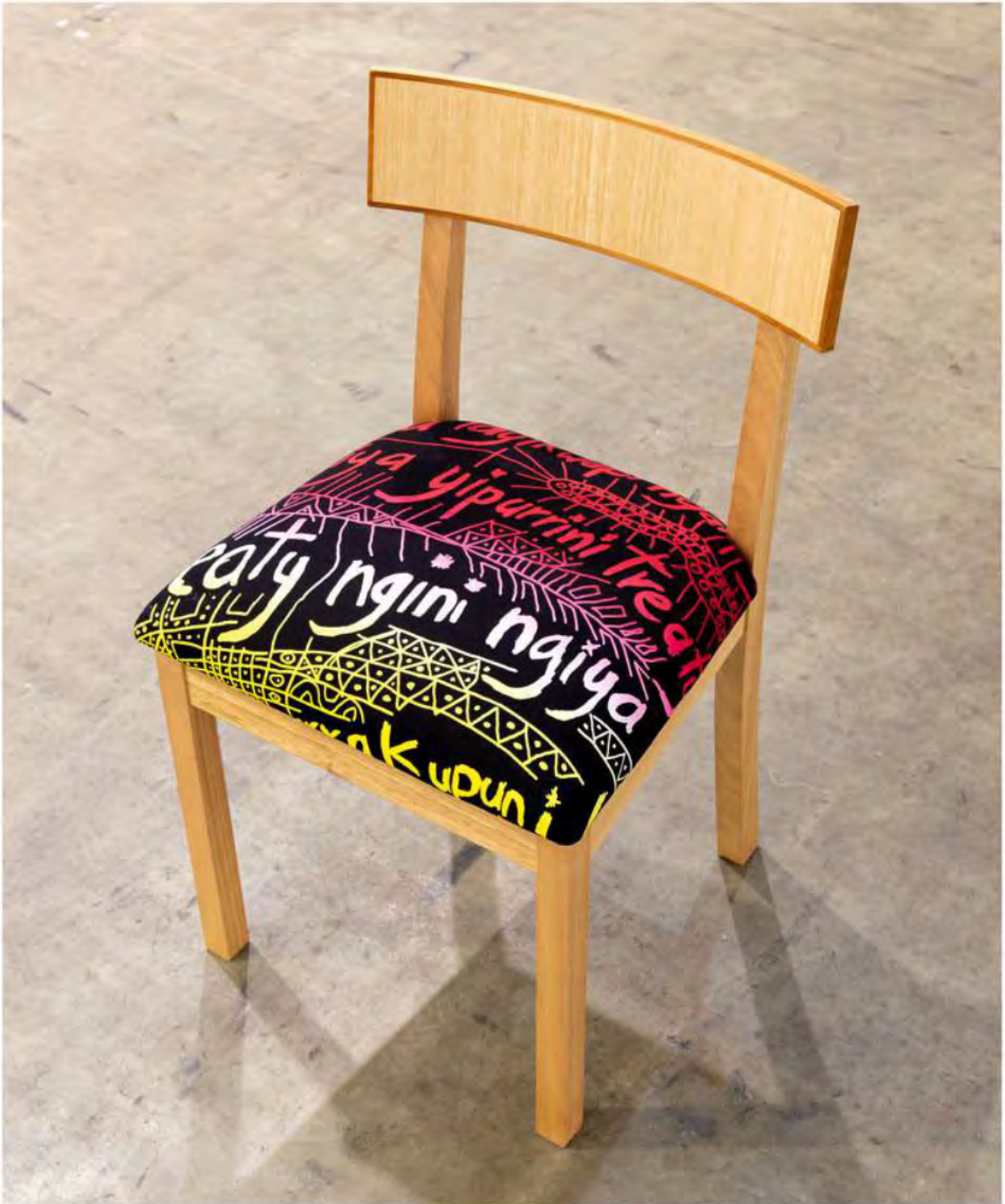
Johnathon World Peace Bush X Rex Heathcote Furniture World Peace, Tiwi Treaty textiles (screen print on hanky linen), Tasmanian Oak with Burl inlay 2022