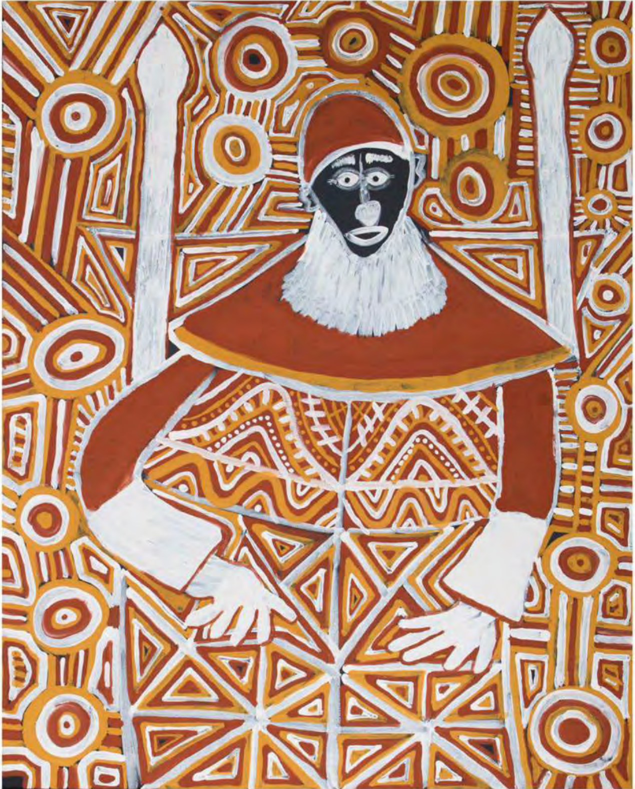
Johnathon World Peace Bush Pope Julius 2021 150cm x 120cm Locally sourced earth pigments on linen