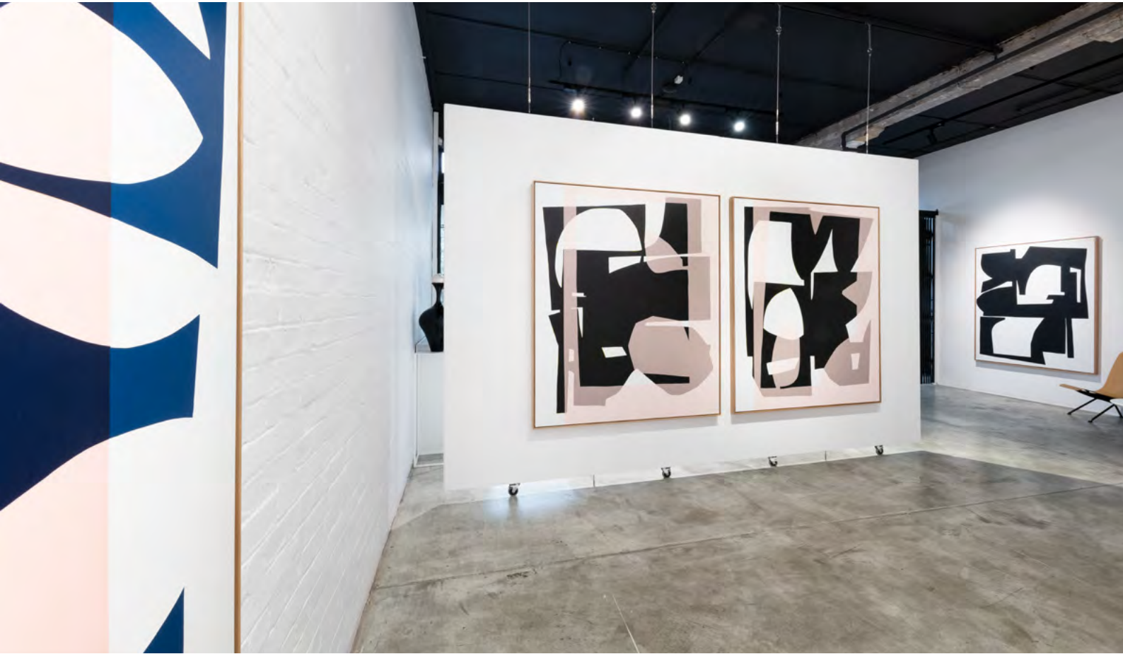
Simon Degroot Oblique Variations , 2022 Installation View THIS IS NO FANTASY