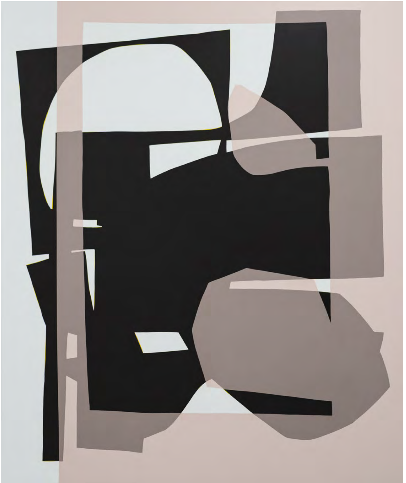
Recline with Rose Tint, 2022 oil on canvas 183 x 152 cm $12,000, Framed