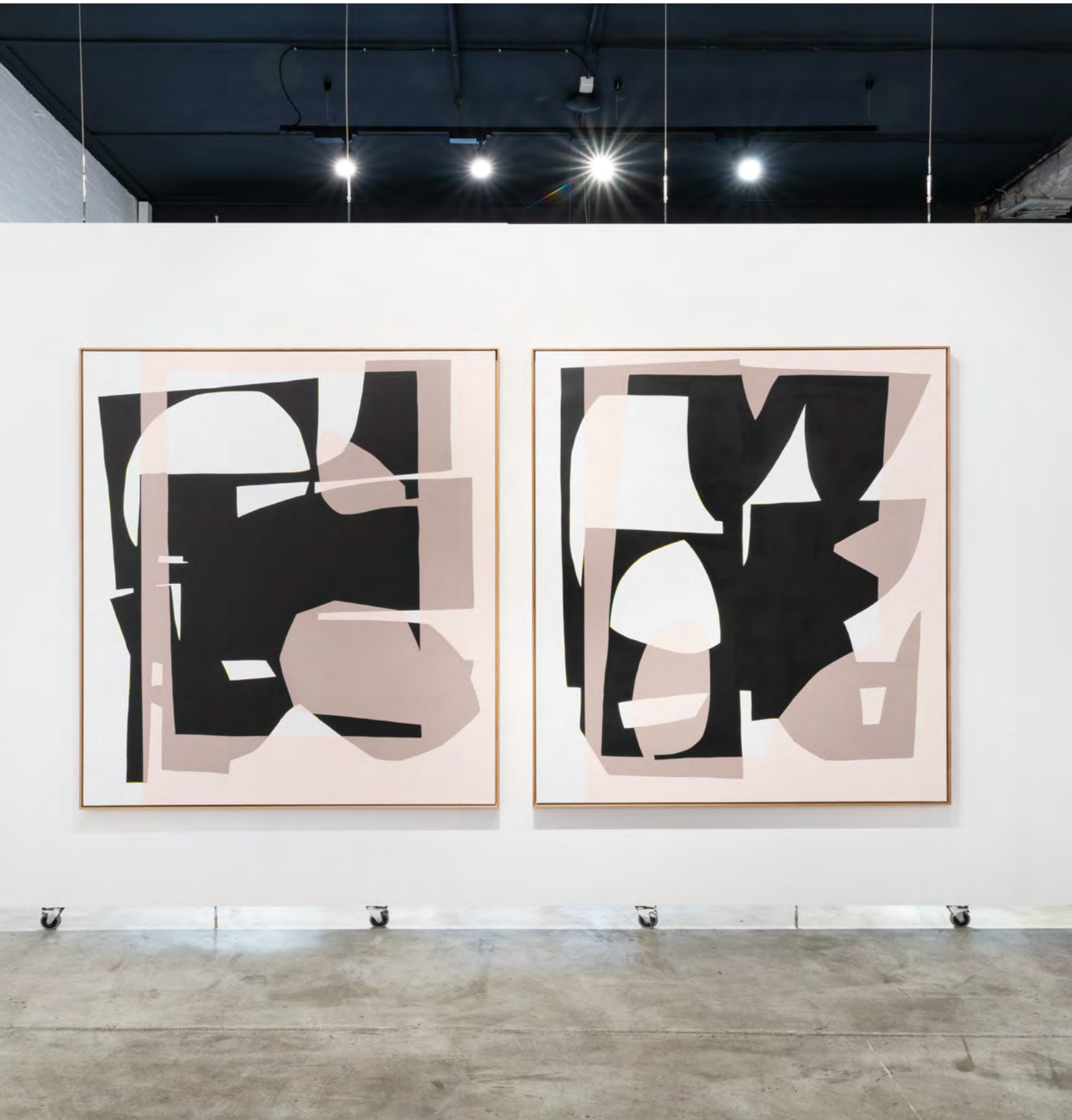
Simon Degroot, Oblique Variations , 2022 Installation View, THIS IS NO FANTASY