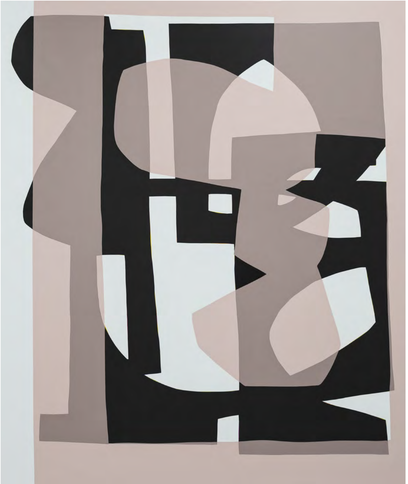
Repose with Rose Tint, 2022 oil on canvas 183 x 152 cm $12,000, Framed