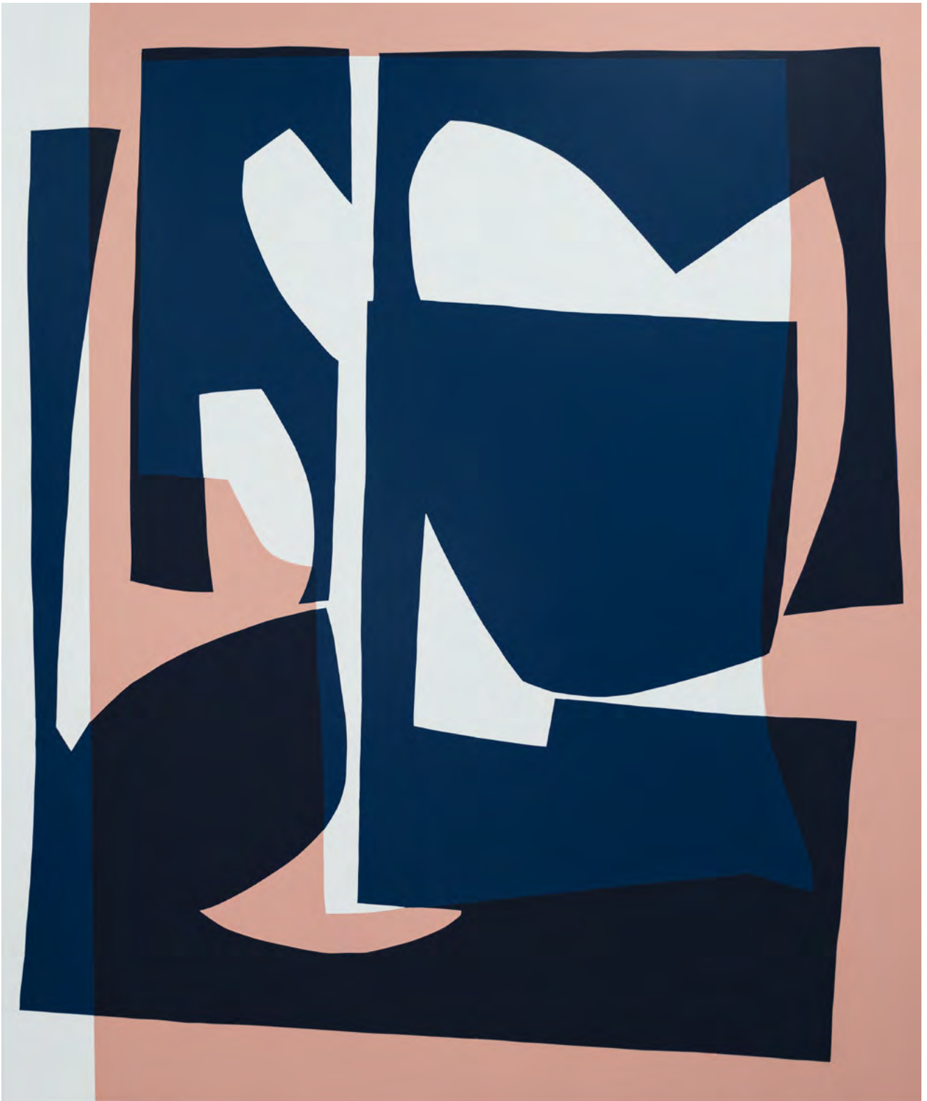
Arabesque with Blue, 2022 oil on canvas 183 x 152 cm $12,000, Framed

THIS IS NO FANTASY by dianne tanzer + nicola stein