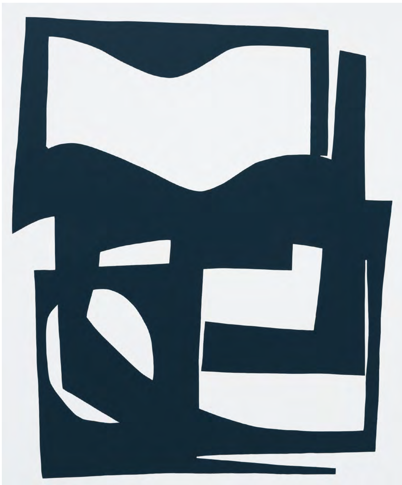
Cavea, 2022 oil on canvas 183 x 152 cm $12,000, Framed