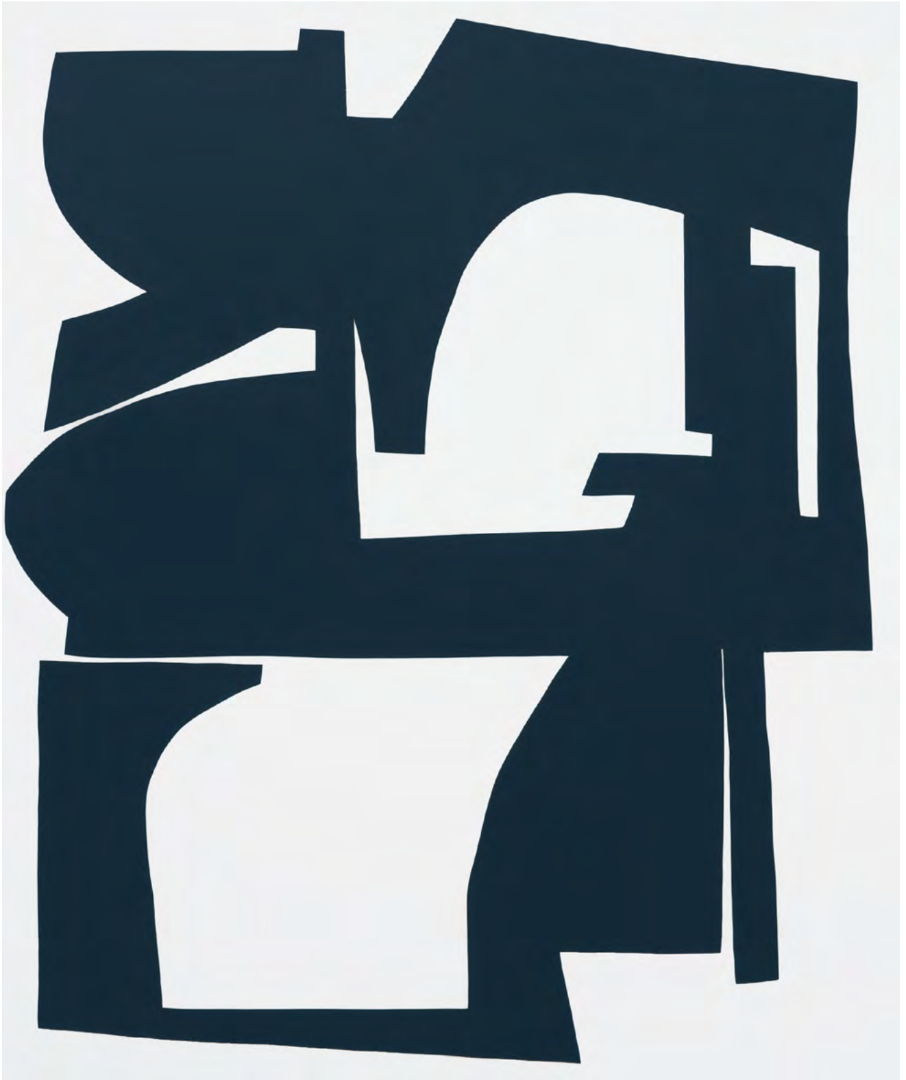
Loggia, 2022 oil on canvas 183 x 152 cm $12,000, Framed