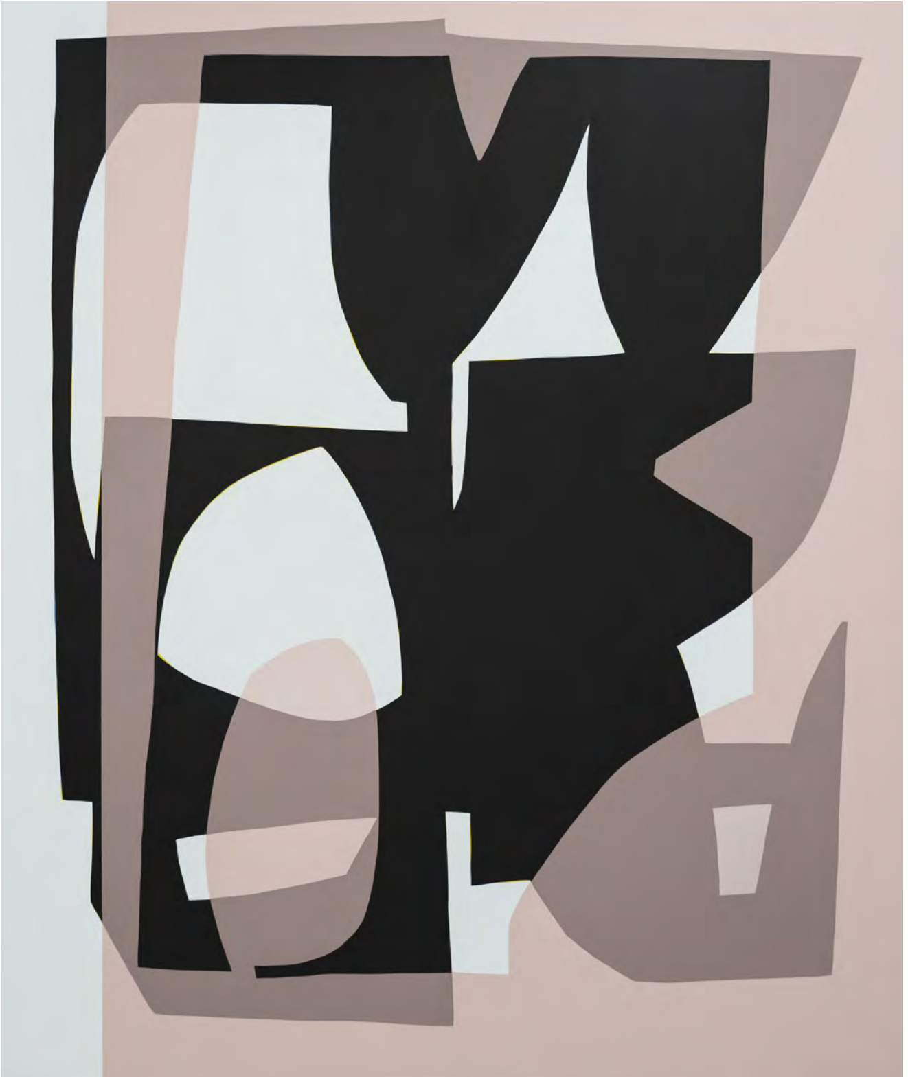
Oblique with Rose Tint, 2022 oil on canvas 183 x 152 cm $12,000, Framed