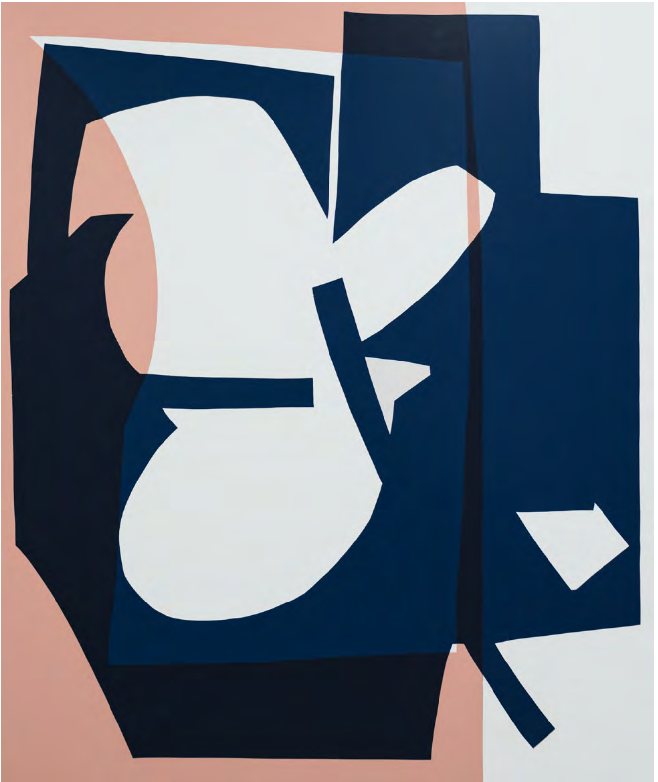
Trefoil with Blue, 2022 oil on canvas 183 x 152 cm $12,000, Framed