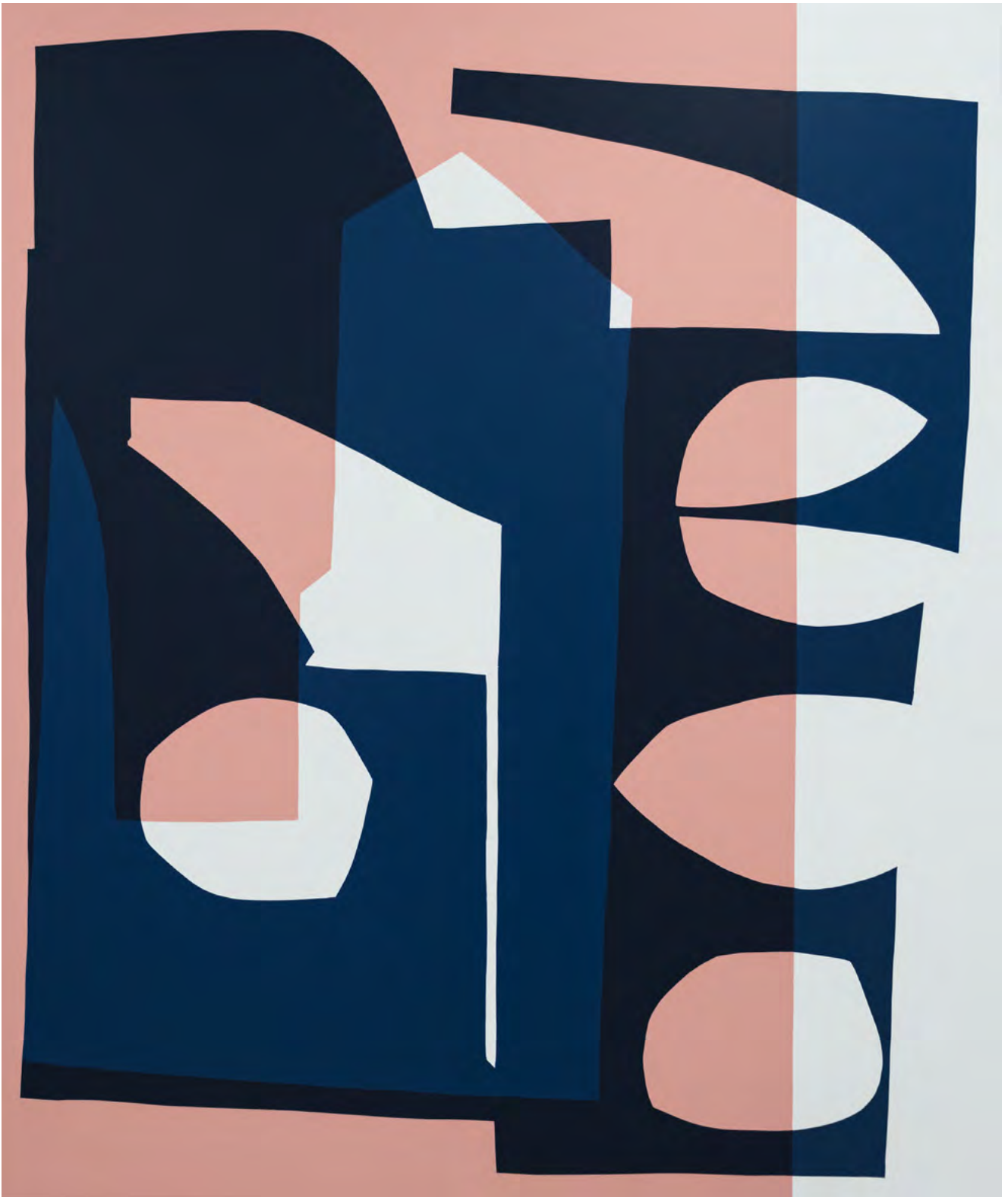
The Dream of Innocent, 2022 oil on canvas 183 x 152 cm $12,000, Framed