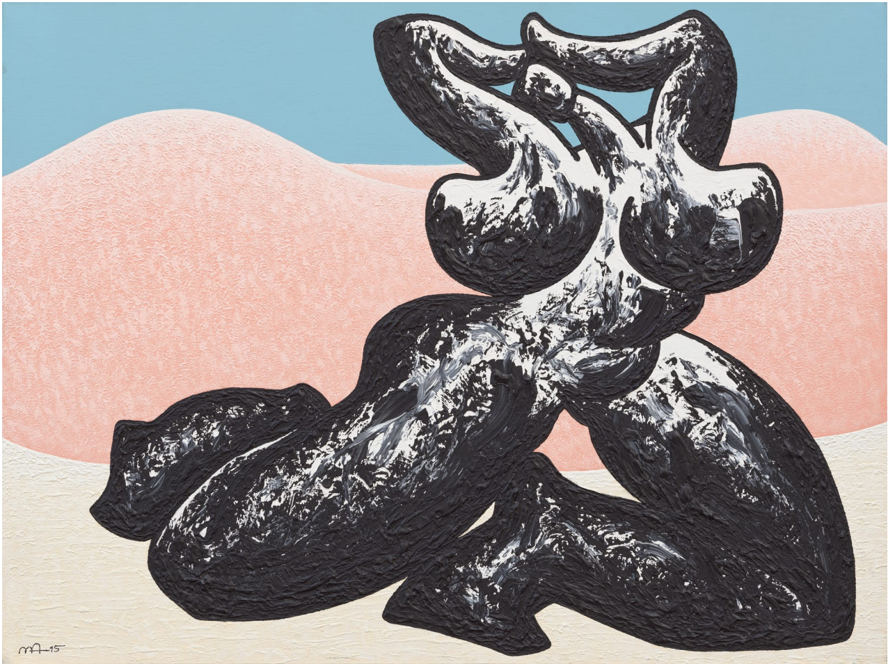
MA DESHENG , Enchanting (陶醉), 2015, acrylic on canvas, 150 x 200 cm.