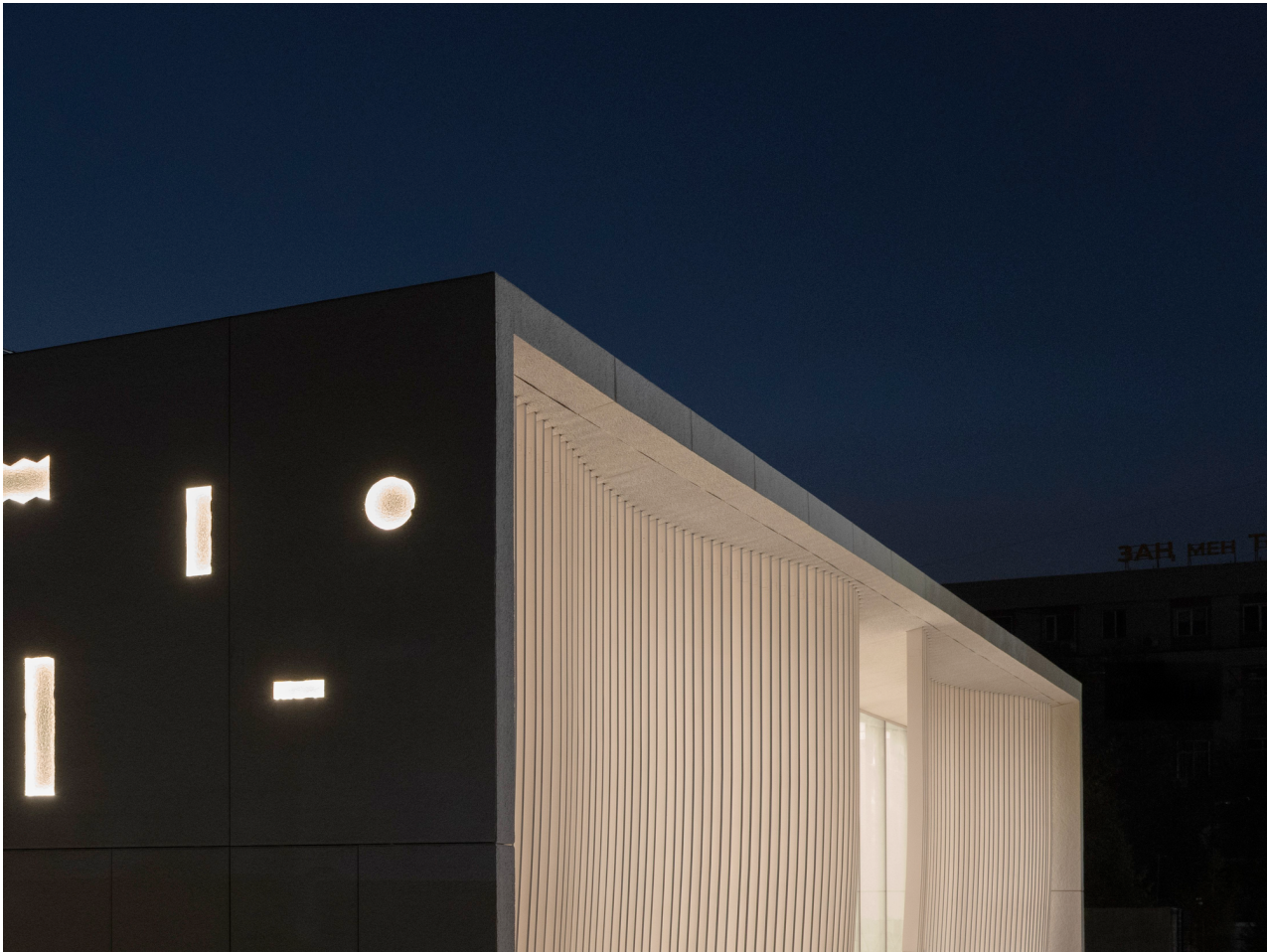
Exterior view of the Tselinny Center of Contemporary Culture, Almaty.