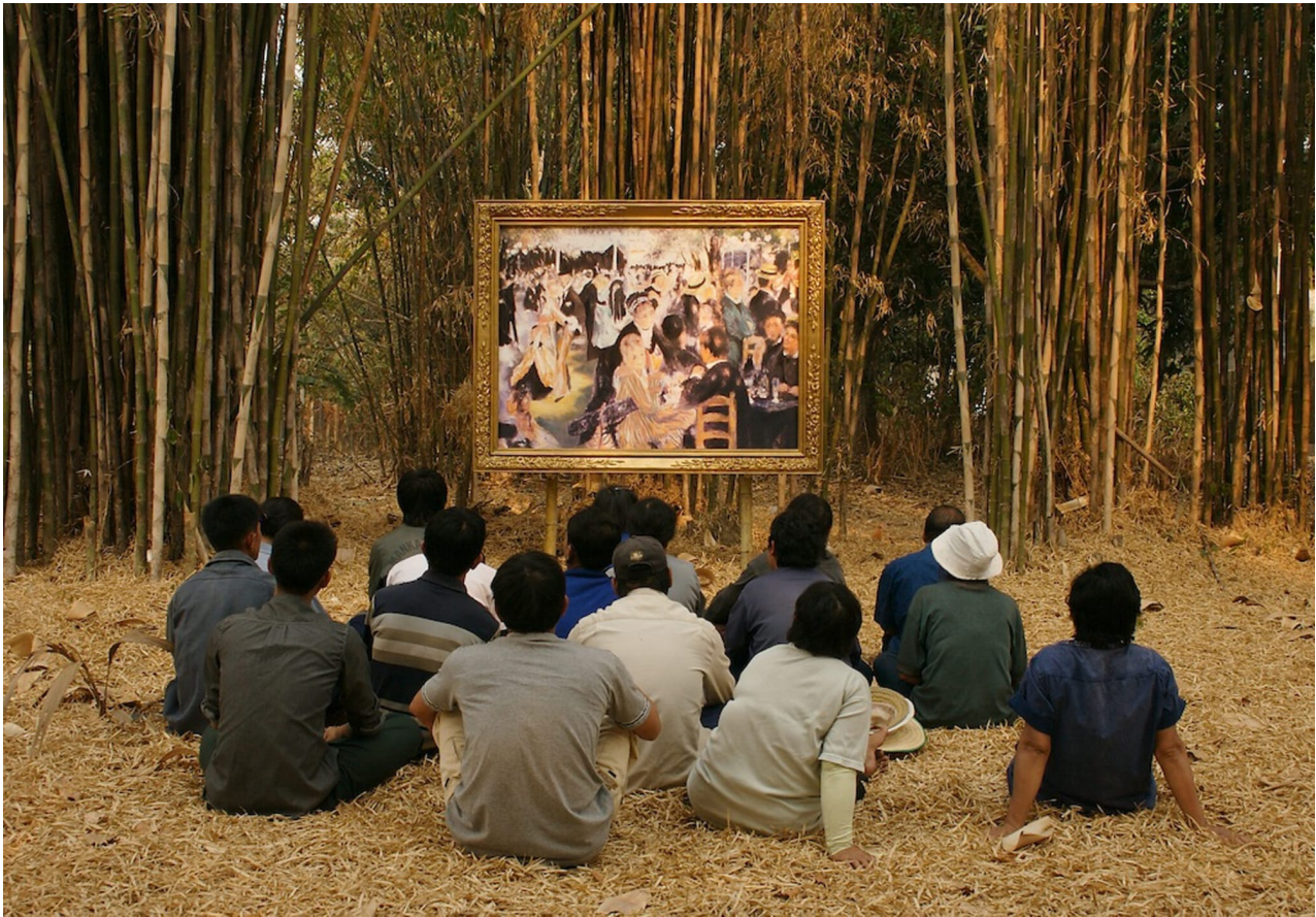
ARAYA RASDJARMREARNSOOK , The Two Planets Series: Van Gogh's The Midday Sleep 1889/90 and the Thai Villagers , 2008, single-channel video: 20 min.