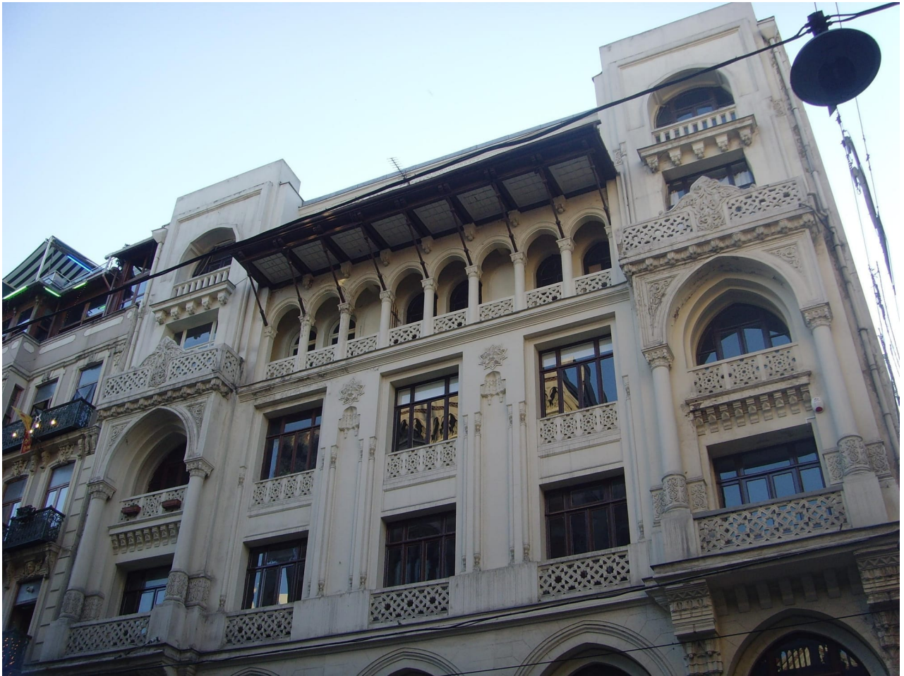
Exterior view of Elhamra Han, one of the venues of the 18th Istanbul Biennial.