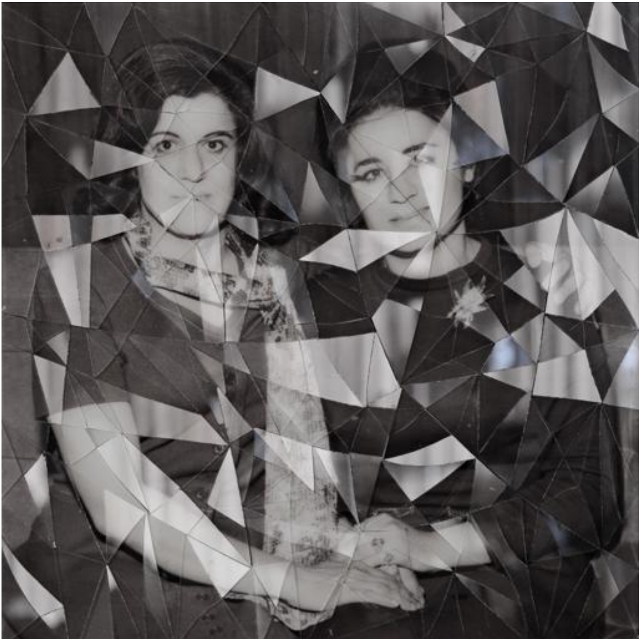
Sisterhood broken by AI Tahayori.

The Museum of Australian Photography (MAPh) has announced the 50 finalists for the 2025 William & Winifred Bowness Photography Prize , selected from more than 750 entries submitted across the country.