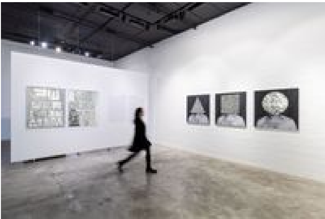
Exhibition view: Ali Tahayori, Looking at Me, Looking at You, THIS IS NO FANTASY , Melbourne (3–26 August 2023).