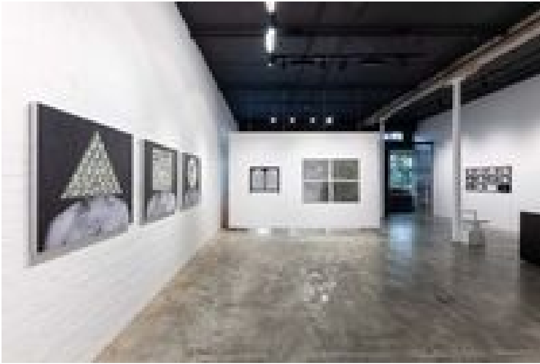
Exhibition view: Ali Tahayori, Looking at Me, Looking at You, THIS IS NO FANTASY , Melbourne (3–26 August 2023).