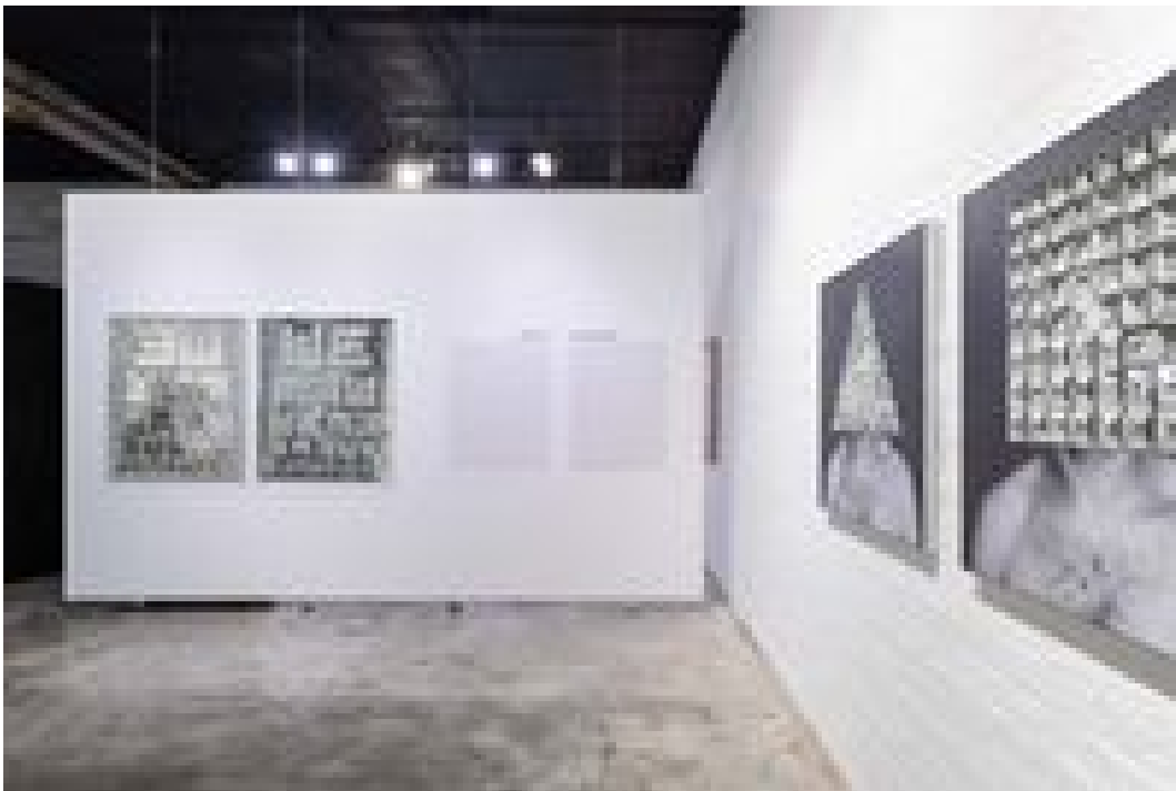
Exhibition view: Ali Tahayori, Looking at Me, Looking at You , THIS IS NO FANTASY, Melbourne (3–26 August 2023).