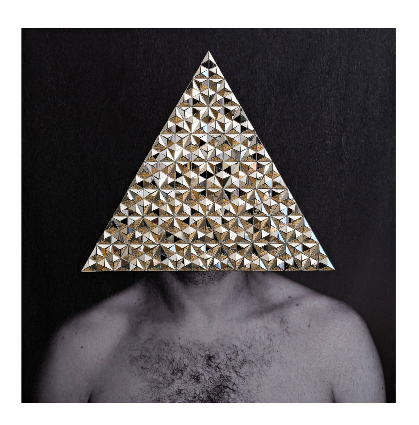
ALI TAHAYORI Geometry of Belonging (triangle), 2023 UV digital print on plywood, hand-cut mirrors, Silicone 95 x 95 cm each, framed $14,000 (triptych)