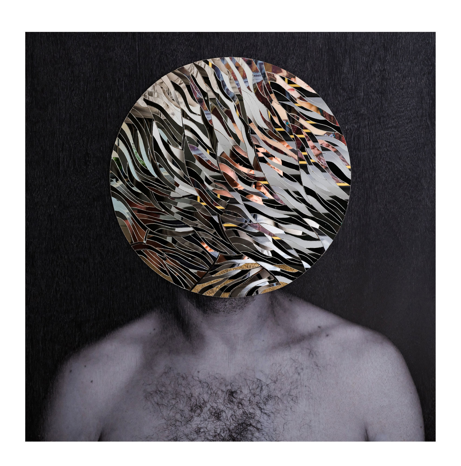
ALI TAHAYORI Geometry of Belonging (circle), 2023 UV digital print on plywood, hand-cut mirrors, Silicone 95 x 95 cm each, framed $14,000 (triptych)