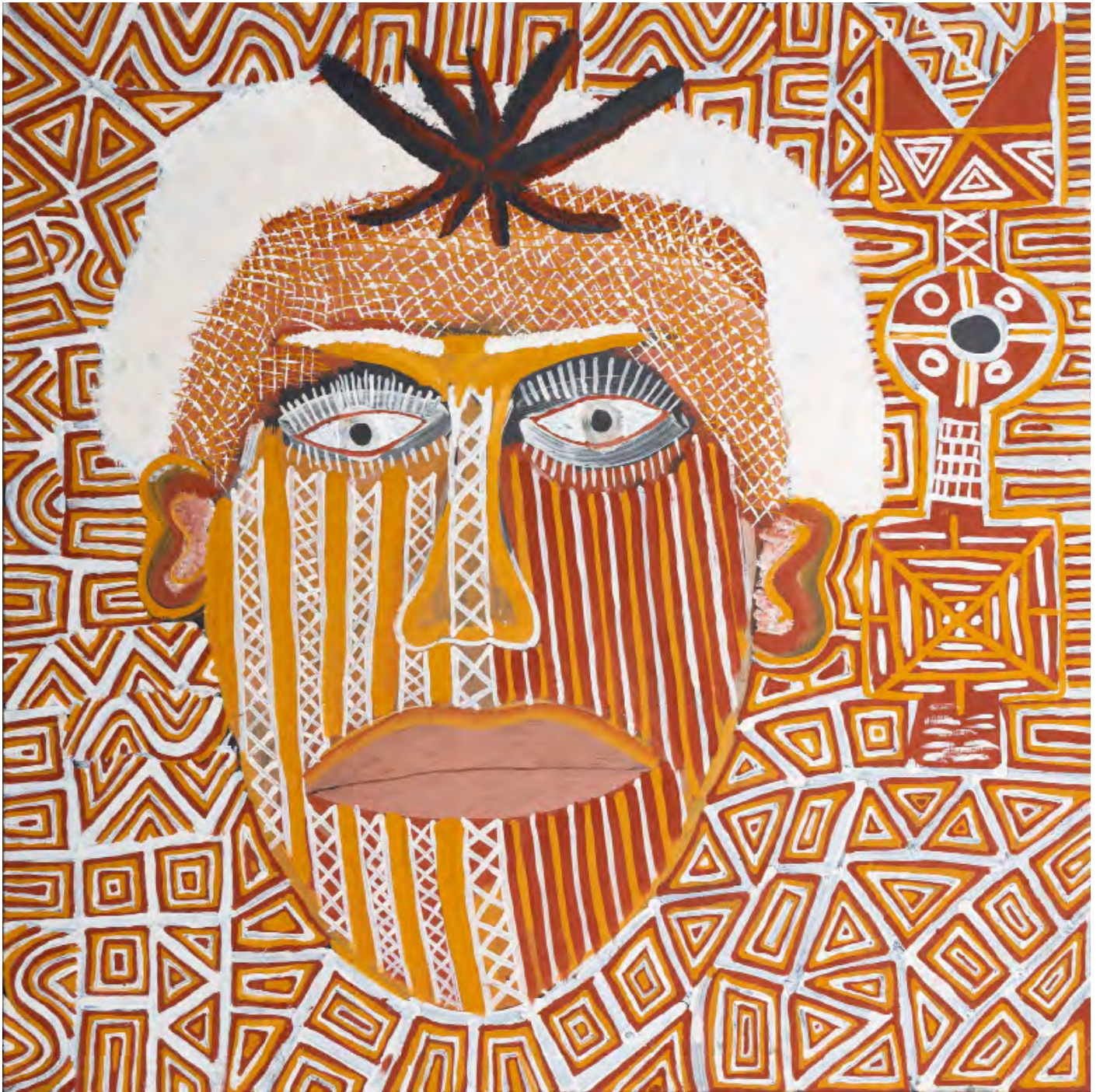
JOHNATHON WORLD PEACE BUSH Mantani Mandela (Nelson Mandela), 2023 locally sourced earth pigments / ochres on linen 150 x 150 cm $16,000