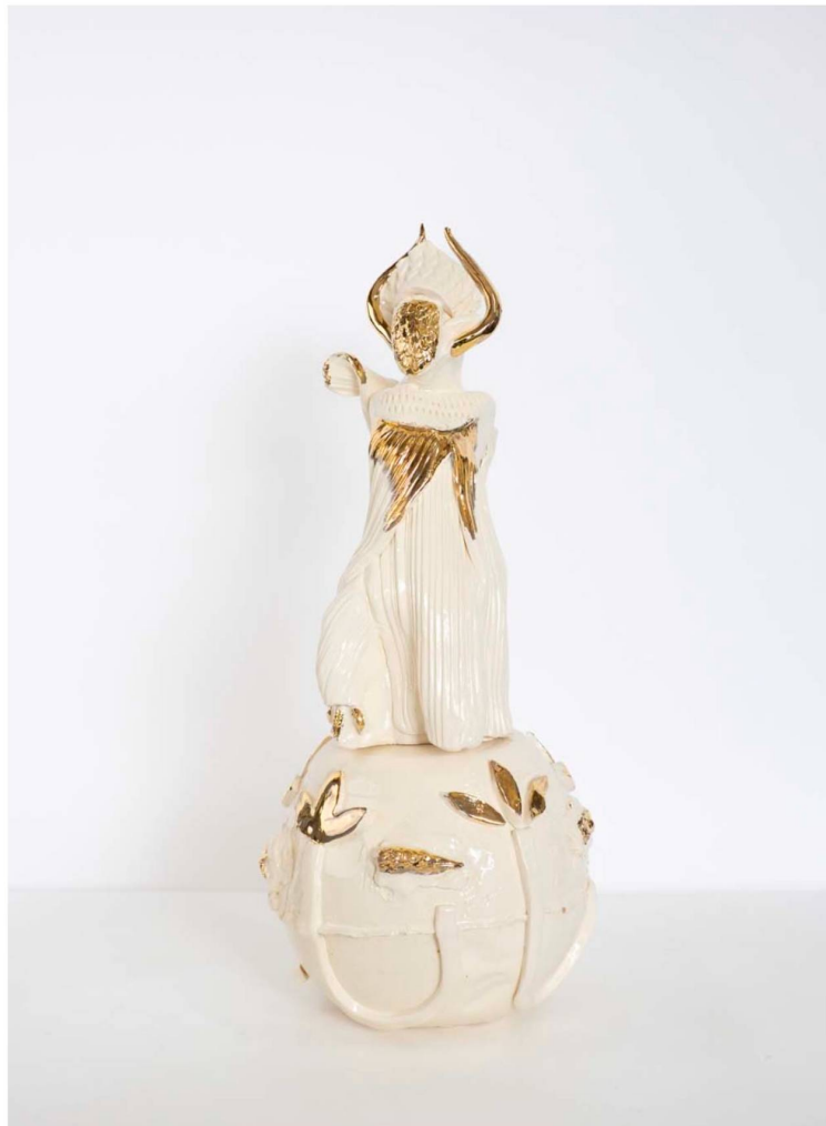
Ara Dolatian, Wind , 2026. Earthenware, glaze, lustre, 46 x 19 x 19 cm.

Presented in a restrained palette of white and gold, the sculptures oscillate between archaeological relic and living body, holding tension between ruin and elevation, absence and presence, while transformation remains ongoing and unresolved.